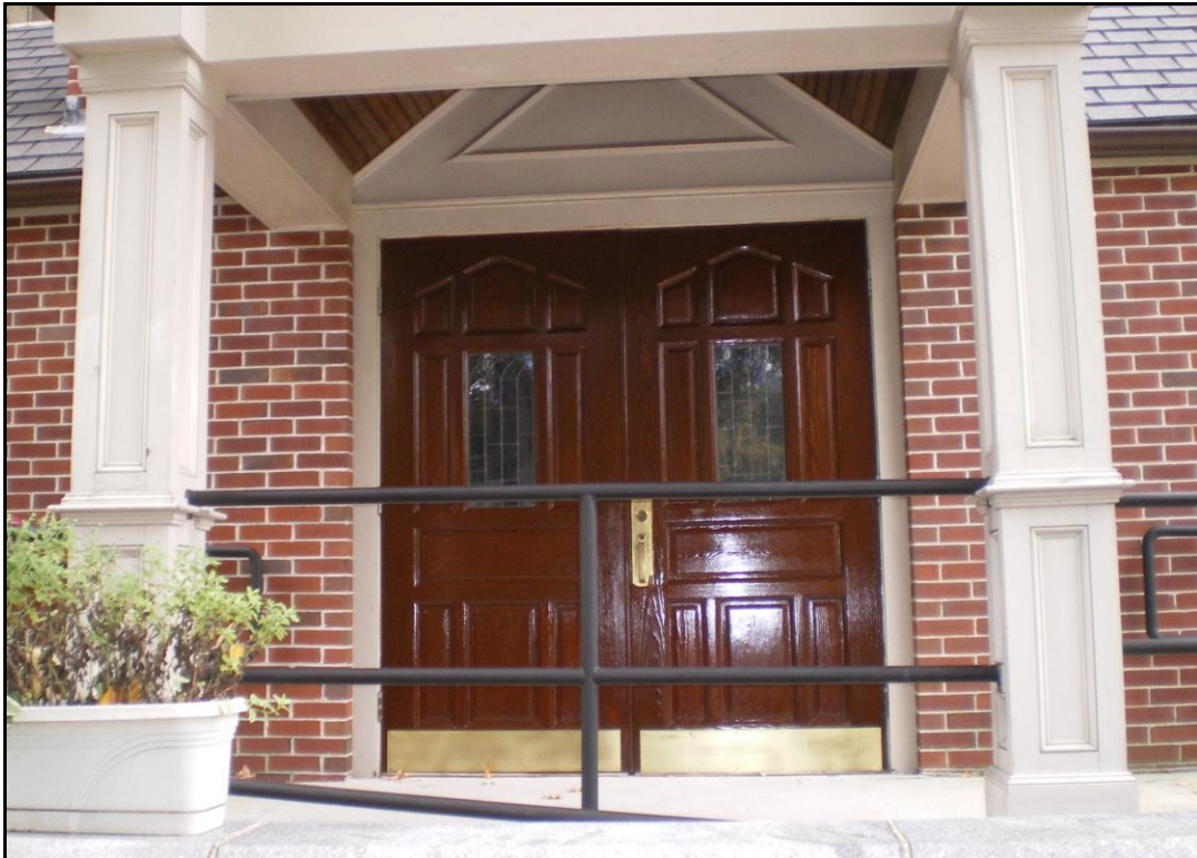
Refinished Rear Exterior Wooden Doors